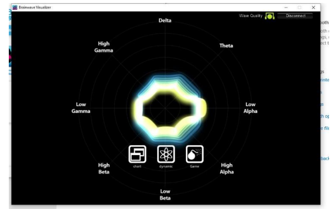
Fig-2: Brainwave visualizer application.

This application requires connectivity with Brain wave sensor headset. By listening to different modes of music, our mind's response will be displayed on screen. We can record our mind's reaction for any specific music tracks [2]. The brain waves vary from person to person and can be analyze different mental states using this Brainwave Visualizer.