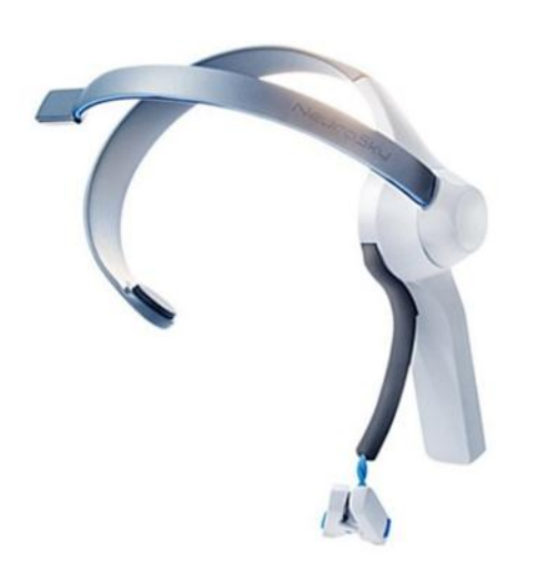
Fig-1: Brainwave sensing module.