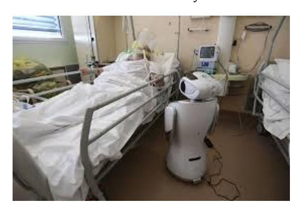
Fig- 4 Patient Monitoring in Hospital

Industry 4.0 plays a major role in healthcare. They are used to convert a hospital digital by providing better information management with the help of IoT. They store data of patients report, medical samples and laboratory identifications. With the help of digital technologies in Industry 4.0 it is easy to identify the symptoms and cause of disease. Industry 4.0 plays a major role in designing and manufacturing of medical tools and devices in lesser time. Health care 4.0 uses highly accurate and precise sensors which reduce the risk of patients during a surgery. Patient monitoring robots are deployed for complete monitor of a patient and all those data are stored securely.