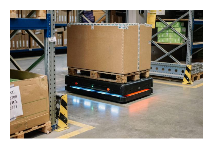
Fig - 3 Autonomous robots used in warehouse

Autonomous robots are widely used in manufacturing industries to increase the speed and production of the process. They work side-by-side with humans to increase the efficiency and also reduce the risk of injuries to employees in dangerous environment. Due to the improved sensor, dexterity, artificial intelligent and trainability in autonomous robots they are becoming faster and collaboratively working with humans. They are also used to improve the supply chain by reducing the manufacturing cost, providing labour and utilization cost and reducing error state.