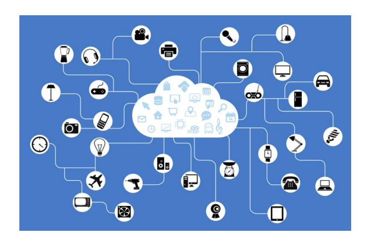
Fig - 2 Cloud Computing

e-ISSN: 2395-0056 IRIET Volume: 07 Issue: 07 | July 2020 www.irjet.net p-ISSN: 2395-0072