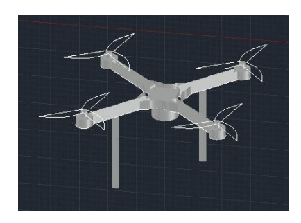
Fig 4. Isometric view of drone