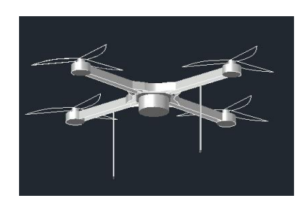
Fig 3. Bottom view of drone