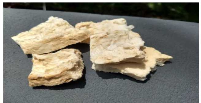
Fig -3: Aerogel

For the treatment of automobile service station waste water the primary process is the production of aerogels for that the orange peel collected from the merchants are dried and powdered, this powder was immersed in 4% sodium hydroxide with solid liquid ratio of 1:15 and this mixture was kept at 40°C for 6 hr under stirring. The filtrate was washed in distilled water and the obtained material was dried at 60°C for 24 hr in oven. the suspension was frozen for 24hr under 18°C and it is then freeze dried in freeze dryer at a temperature 55°C for 24 hr to obtain sponge aerogel. The production of the aerogel is a complex procedure and when gel formation is not occurred properly during the initial stage agar or gelatin can be applied for the thick consistency of the gel.