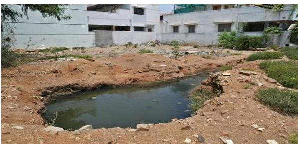
Fig -1: Effluent

Water drainage is the primary problem associated with a car wash. Much soap contains harmful chemicals that degrade water quality. The pollution problem is only compounded when the soapy water is mixed with the grime, dirt and grease removed from a vehicle. Here the effluent was collected from BRD car world Thaloor in Thrissur district