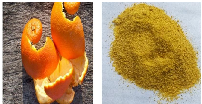
Fig -2: Orange peel

The orange peel is collected from the nearby merchants. The orange peel was washed in acetone and distilled water and kept for oven dry for 2 weeks. The cellulose based material separately grinded and sieved in 75nm sieve was taken. On the other hands orange peel contains high pectin content these pectin content in orange peel result in the increased absorption of the oil since pectin is hydrophobic to water and hydrophilic to oil. Orange peels are highly porous in nature and hence it will absorb more oil since the absorption capacity is high. This orange peel is also ecofriendly and hence it can be easily used and decomposed