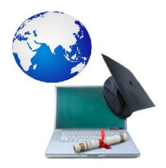
Fig.3. Power of E-Learning

throughout the region in schools. When computers and the internet developed in the late 20th century, e learning tools and delivery methods also got Extended. The first MAC in the 1980's allowed individuals to have computers in their homes, making it easier for them to learn about specific subjects and acquire other sets of skills. Virtual learning environments then began to thrive in the following decade, with people gaining access to a wealth of educational information and opportunities for e - learning. Currently, companies began using e - learning to train their employees in the 2000's. New and experienced workers alike have now had the opportunity to improve their knowledge base in the industry and broaden their skill sets. At home individuals were given access to programs that offered them the ability to earn degrees online and enrich their lives through expanded knowledge. Today, e - learning is more common than ever, with countless people realizing the benefits that learning online will offer.