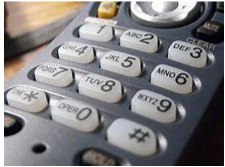
Figure 1.2 A standard telephone keypad.

Most of the keys also bear letters according to the following system: