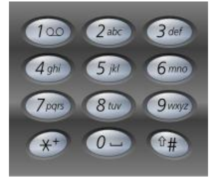
Figure 1.1A standard modern telephone keypad, as used for text messaging.

A telephone keypad is a keypad that appears on a "Touch Tone" telephone. It was standardized when the dual-tone multifrequency system in the new push-button telephone was introduced in the 1960s, which gradually replaced the rotary dial. The contemporary keypad is laid out in a 4×3 grid, although the original DTMF system in the new keypad had an additional column for four now-defunct menu selector keys. When used to dial a telephone number, pressing a single key will produce a pitch consisting of two simultaneous pure tone sinusoidal frequencies. The row in which the key appears determines the low frequency, and the column determines the high frequency. For example, pressing the '1' key will result in a sound composed of both a 697 and a 1209 hertz (Hz) tone.