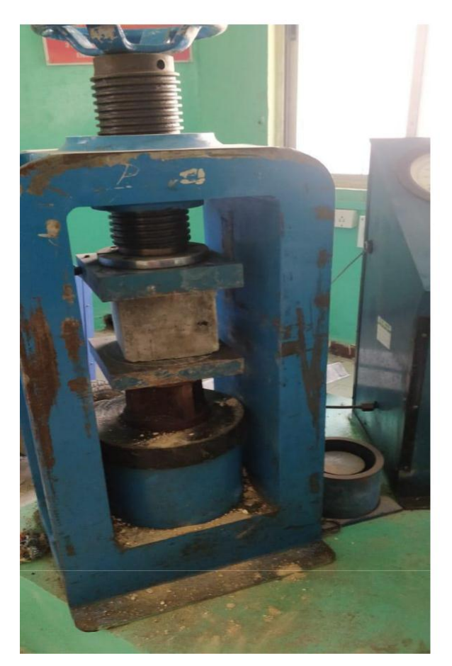
Fig. 3 – Compressive strength test of conventional concrete cubes.