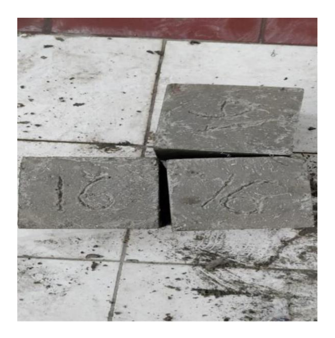
Fig. 2 – Conventional concrete cubes

International Research Journal of Engineering and Technology (IRJET) IRJET Volume: 07 Issue: 08 | Aug 2020 www.irjet.net