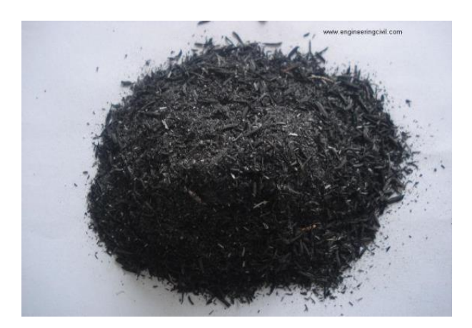
Fig. 1 - BAGASSE ASH

The fibrous residue of sugarcane after crushing and extraction of its juice, known as 'bagasse', is one of the largest agriculture residues in the world. Literature illustrates the versatility of sugarcane residue usages; through its conversion inclusive but not limited to paper, feed stock and biofuel. The utilization of these waste materials in the manufacture of concrete provides a satisfactory solution to some of the environmental concerns and problems associated with waste management. Agro wastes such as rice husk ash, wheat straw ash, hazel nutshell and sugarcane bagasse ash are used as pozzolanic materials for the development of blended cements. Few studies have been reported on the use of bagasse ash as partial cement replacement material in respect of cement mortars. In this project, the effects of bagasse ash as partial replacement of cement on strength and durability properties of hardened concrete paver blocks are studied.