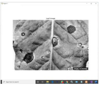
Fig-3: Leaf Image