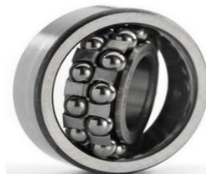
Fig 2 - Ball Bearing