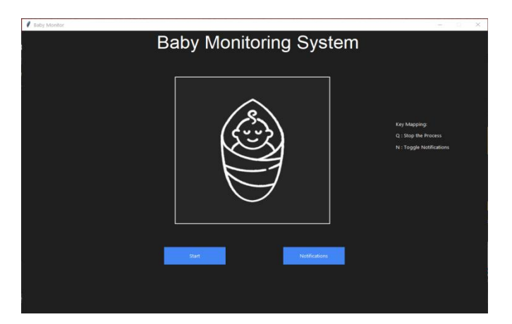
Figure 5.2 Application implementation