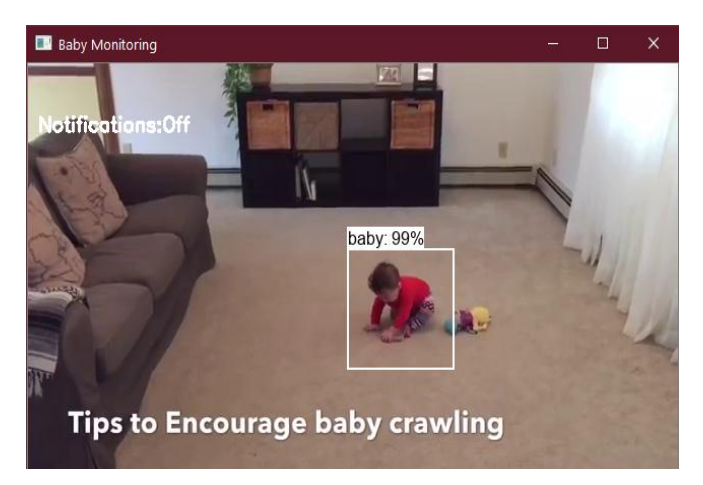
Figure 5.1 Baby Detection

In this paper, we introduced a desktop application to detect whether the baby is present or not and depending upon that it sends a notification to the parent/guardian.