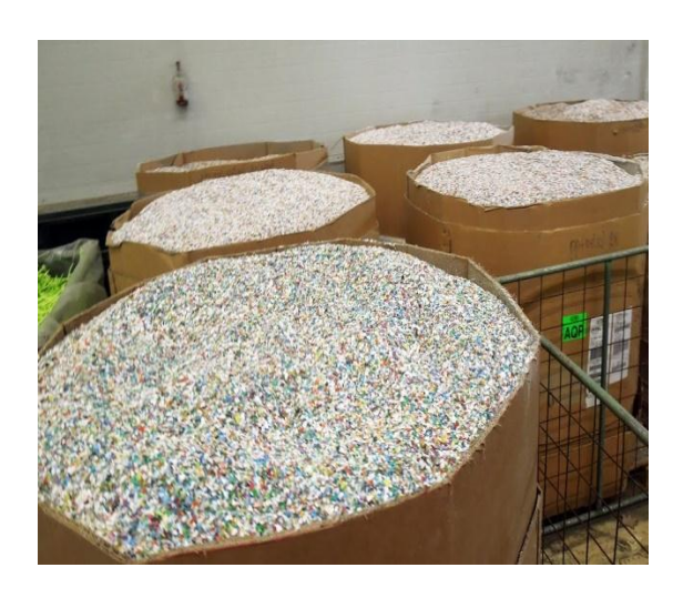
Fig 5 - Collected plastic after shredding