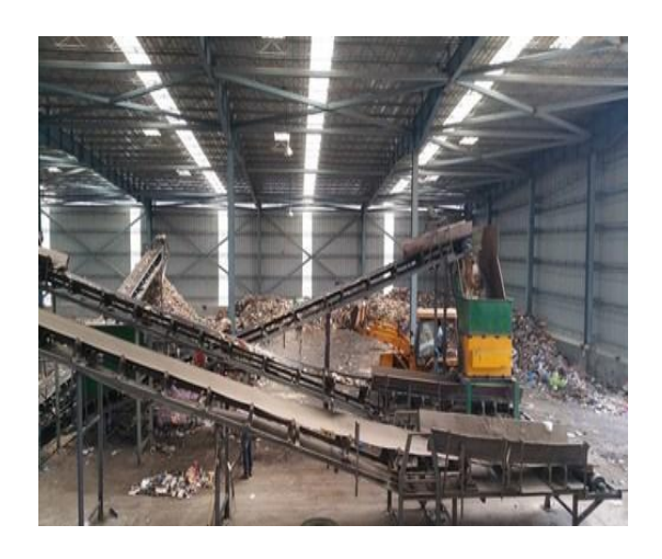
Fig 2 -Segregation

(b) Cleaning: Wet grinding: the cleaned plastic bottles are shredded to 1 cm flake Washing: the use of waste water from the close by waste website and our patent pending cleaner, shredded plastics are cleanedina especially designed washing shredded plastics are cleaned in a specifically designed washing unit.