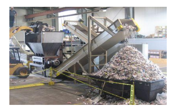
Fig 4 - shredding

(C) Shredding:- In wet system, shredded plastics are directly added to the hot asphalt of binder, and they are heated and combined thoroughly to obtain as uniform mixture. Polymer-modified asphalt binders are prepared in this manner, commonly with the help of a sophisticated equipment. High power stirring may be indispensable to attain a