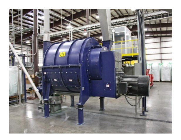
Fig 3- Cleaning

(C) Shredding:- In wet system, shredded plastics are directly added to the hot asphalt of binder, and they are heated and combined thoroughly to obtain as uniform mixture. Polymer-modified asphalt binders are prepared in this manner, commonly with the help of a sophisticated equipment. High power stirring may be indispensable to attain a