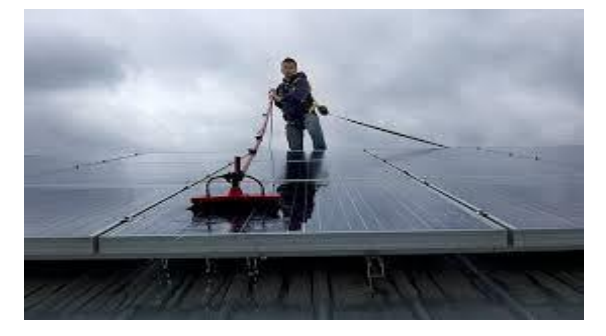
Fig – 5: shows suction cleaning

A vacuum suction cleaner is a device that uses an air pump to create a partial vacuum to suck up dust and dirt, usually from floors, window panes etc. In general the electrical supply is given to the vacuum cleaner motor which creates the suction pressure. The power consumption of the vacuum cleaner is in watts and it does not justify the effectiveness of the cleaner. The input power is converted into airflow at the end and is measured in air watts. The vacuum cleaner can clean the panel properly only on the surfaces other than the corners and this has to be handled manually