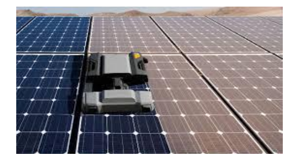
Fig- 6 : Automatic cleaner robot.

The automatic wiper based cleaning incorporate a rubber wiper and water pot for the spray of water with additives and cleaning. The process is exactly like vehicle glass cleaning and require a automatic mechanism to operate and complete the task. Mechanism is battery operated as shown in Figure 4. This method is similar to earlier one and operated automatically by the suitable control mechanism but the impacts are similar to those earlier ones.