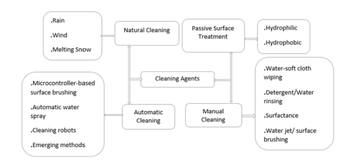
Fig - 3: shows different dust removal method used to clean the PV panels

Solar Photovoltaic panels are constantly exposed to various types of weather conditions throughout the year and are thus the target for dirt, dust, industrial residues, atmospheric pollution, algae, mosses, bird droppings etc. The agents and chemicals used during cleaning of the surfaces attract dirt and accelerate the deterioration process with negative repercussions on the appearance and mainly on the function of the PV panel.