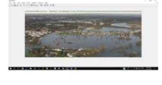
Fig 3. After Flood