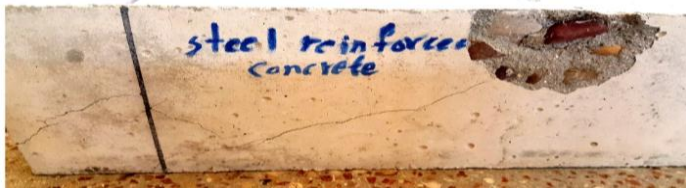
D) Fig 13. Typical fracture of steel RC

Conclusions: From this work following conclusions are made: