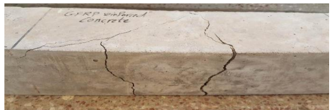
B) Fig11. Typical fracture of smooth GFRP RC.