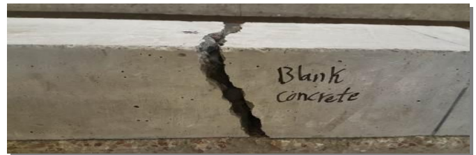
A) Fig 10. Typical fracture of unreinforced concrete