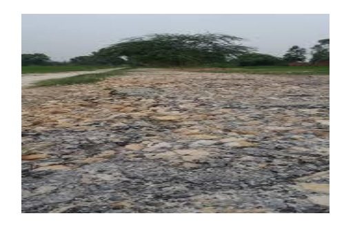
Key Words: leachate, rice husk, black cotton, CBR, Atterberg's limit, OMC, MMD

Leachate influenced soil is settled with the Rice Husk to improve its quality properties.