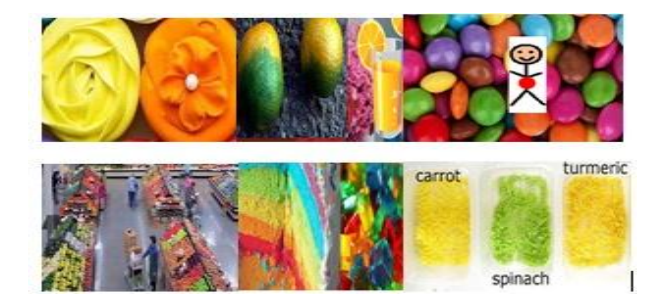
Fig -2:Some products containing Acid Yellow 23 [19].

Several food stuffs impart different concentration of Acid Yellow 23 (E102), relying on the industrialist or on the cook administrator. Considering its negative impact nowadays focus has been directed more towards using non synthetic colouring material like annatto, malt colour or beta carotene in place of Acid Yellow 23. Foodstuff containing Acid Yellow 23 (E102) includes sweetmeat, soft drinks, cotton candy, cereals (corn flakes and muesli), flavoured chips (Doritos and Nachos), cake combinations, soups, jam, sauces, ice cream, some rice, candy, chomping gum, marzipan, jelly, gelatins', mustard, marmalade, yogurt, noodles, fruit pleasant and product, chips and several expediency foods together with glycerine, lemon and honey products, soft drinks (Mountain Dew and Mirenda), energy drinks, prompt desserts, and some product containing Acid Yellow 23 (E102) as shown in Fig- 2.