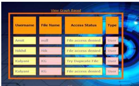
Table-2: Graphical User profiling detection