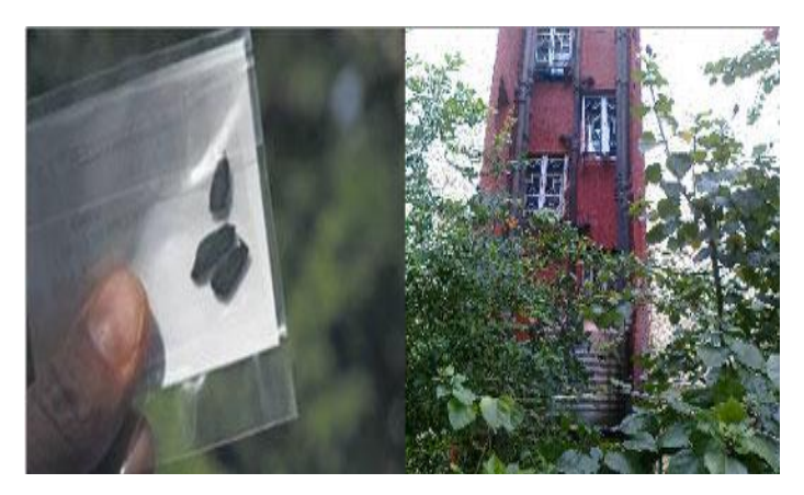
Fig -1: BIOSANITIZER ECOCHIPS

4. The largest percent of desalinated water used in any country is Israel, which produces 40% of its domestic water use from seawater desalination.