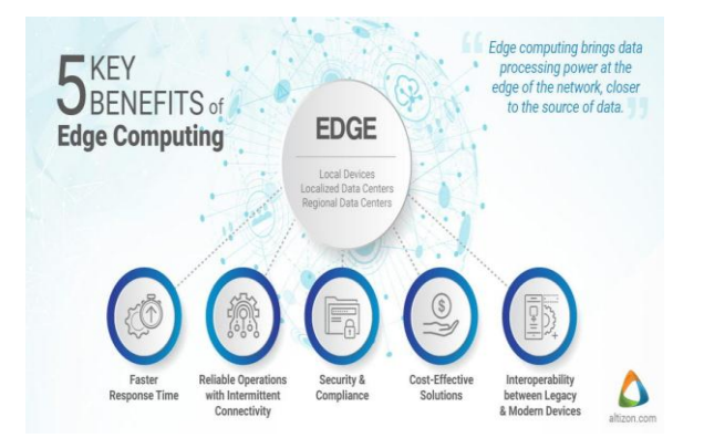
Fig.3: Benefits Of Edge Computing

Restricted by the size and usage scenarios, IoT devices usually have quite limited energy supply, but they are also expected to perform very complex tasks that are usually power consuming. It is challenging to design a cost-efficient solution to well power the numerous distributed IoT devices given that frequent battery charging/discharging is impractical in not possible.