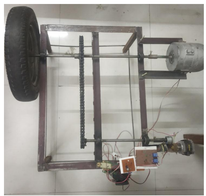
Fig -1: Quarter model vehicle with Regenerative Braking System