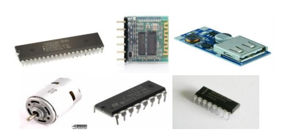
Fig -3: Microcontroller 8085, HC-05, Max 232, DC motor, L239D, 12V power supply.