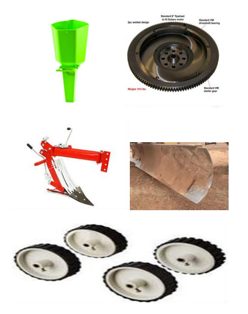
Fig -4: Seed storage funnel, Fly wheel, Jaw, Flip panel, Wheels.