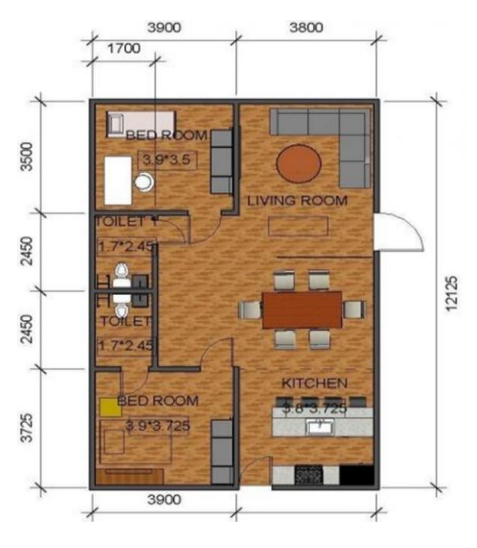
Fig-2 : Ground floor plan

one dinning, one kitchen. The divisions of the rooms in the plan has been done with due consideration of sun diagram as per the condition of zero energy building. The plan has been prepared using Auto CAD software.