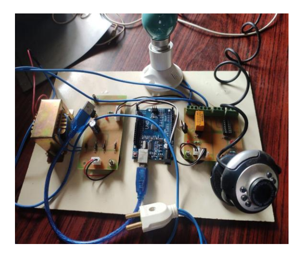
Fig -5: HARDWARE DEVELOPED