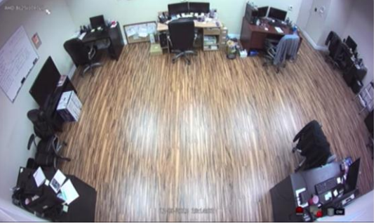
Fig -2: INITIAL IMAGE

The qualitative detection results are shown in the figure including multi-feature combination comparison strategy. It seems that when people enter the room the air conditioner starts running and when the people leave the room the air conditioner turns off.