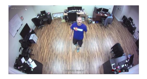
Fig -3: COMPARED IMAGE AND AIR CONDITIONER STARTS