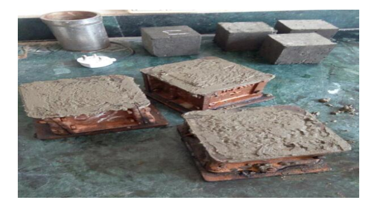
Fig -1: Casting of Cube

and laterite soil respectively are mixed. We use foaming agent to reduce the weight by foaming foam (voids) in concrete with air entering agent. Foam in the concrete mix can create through forcing the chemical, air and water. In this experimental work protein based foaming agent is used.