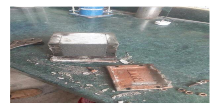
Fig -2: Mould opening