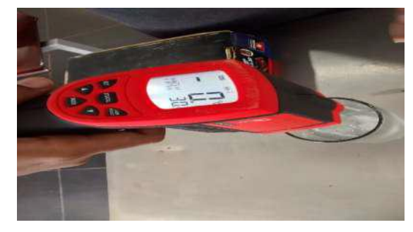
Calibration of thermometer

the thermal properties of the specimens are tested under normal temperature. The main source of heat is considered to be emitted from the specimens that are placed under direct sun light on a raised platform. The temperature on the surfaces are measured using an infrared thermometer. The thermometer is calibrated using a glass of ice. The outer temperature and the inner temperature is measured in a time interval of 1 hour from 7am to 7pm.