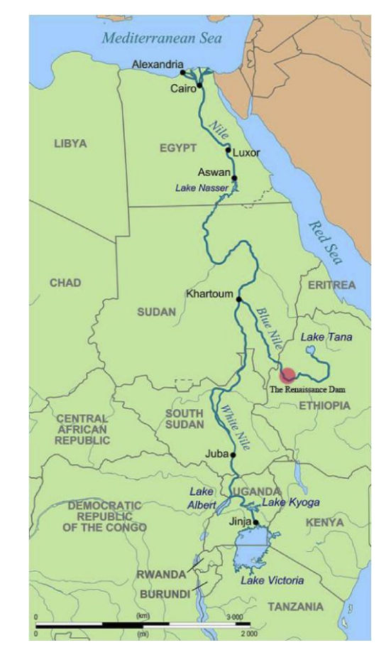
Fig -1: Map of the Nile Basin with Location of GERD (Mobasher, 2016)

has always been a source of regional disputes. The Egyptian government, a country that depends closely on the waters of the Nile, protested the dam, which it believed would decrease the quantity of water it obtains from the Nile. (Goor, Q et al., 2010).