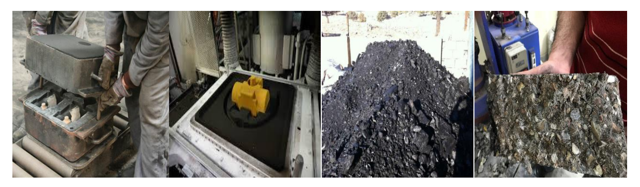
Fig 2: Utilization of foundry sand in different applications.

Foundry sand is mainly fine aggregate. It can be utilized indifference ways mostly is used for molding and casting operations or in the same ways as artificial manufactured sands. It utilized in many civil engineering applications such as embankments, flow able fill, hot mix asphalt (HMA) and Portland cement concrete (PCC). Foundry sands have also been used extensively agriculturally as topsoil. Currently, approximately 500,000 to 700,000 tons of foundry sand is used annually in engineering applications. The largest volume of foundry sand is used in geotechnical applications, such as embankments, site development fills and road bases Fig.2 (Associate & Budhgaon, 2017).