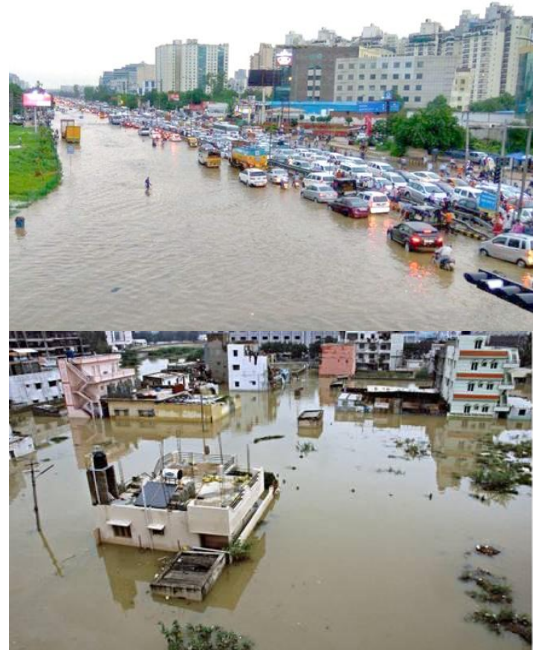
Fig 1. Flooding images of urban areas

Abstract - Urban flooding is of developing worry because of expanding densification of urban territories, changes in land use, and environmental change. The customary designing way to deal with flooding is planning single-reason seepage frameworks, dams, and levees. These techniques, nonetheless, are known to build the drawn out flood danger and mischief the riverine environments in urban just as rustic regions. In the current paper, we leave from strength hypothesis and propose an idea to improve urban flood versatility. We distinguish territories where contemporary difficulties call for improved community urban flood the board. The idea stresses flexibility and accomplished cooperative energy between expanded ability to deal with stormwater spillover and improved experiential and useful nature of the urban conditions. We recognize research needs just as investigations for improved maintainable and versatile stormwater the executives in particular, adaptability of stormwater frameworks, energy use decrease, effective land use, need of transport and financial nexus, environmental change sway, making sure about basic foundation, and settling questions with respect to obligations.