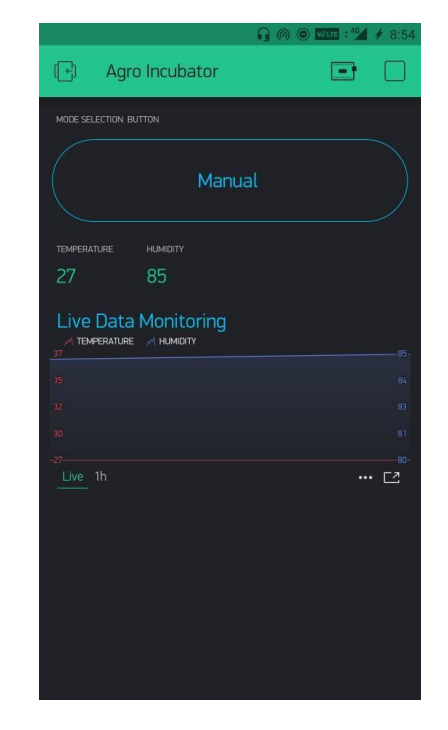
Fig 6.2: User interface of the proposed system

Bynk is a new platform that allows your iOS and Android device to quickly build interfaces for controlling and monitoring hardware projects. The android connects via Wi-Fi with Raspberry Pi. Changes made on the application are pushed through the serial port and communicated to Raspberry Pi. The Raspberry PI communicates with serial communication which means that one bit at a time data is transmitted. It is introduced using a standardized asynchronous receiver/transmitter (UART) and is a circuitry unit responsible for the serial contact implementation.