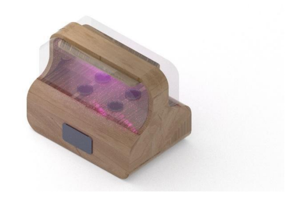
Fig 7.2 Incubator Box

The incubator contains mainly three blocks. We can call these blocks as block 1, block 2 and block 3. The thickness of each block is 3mm. block 1 is 30cm wide, block2 20cm wide and block 3 15cm wide. Block 1 is the topmost block. It contains four holes. Diameter of each hole is 4cm. The plants are grown in these holes. The holes are kept at a distance of 10cm from each other. That is a hole has 10cm distance with the two adjacent holes. The top side contains the grow light which helps the plants in photosynthesis and provides the temperature required for its growth along with the heating/cooling fan. In the backside of the box there is a door between blocks 2 and block 3. The block 3 contains all the hardware components including controller Raspberry Pi 4. The working of aeroponics process of providing nutrients for the plants using atomizer can also be viewed in the block 2.