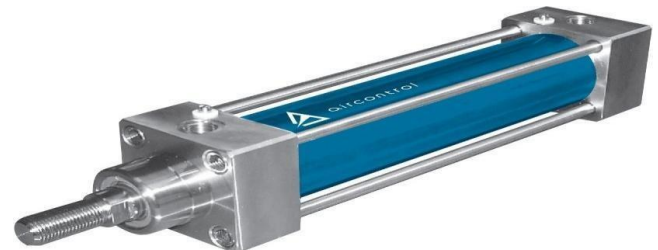
Fig. single acting cylinder

of the machine. 1. Pneumatic single acting cylinder, 2Solenoid valve 3. Flow control valve 4. IR sensor 5.unit Wheel and brake arrangement 6.PU connector, 7.reducer, 8.hose 9.collar 10.Stand 11.Single phase induction motor. PNEUMATIC SINGLE ACTING CYLINDER: Pneumatic cylinder consist of A) PISTON B) CYLINDER