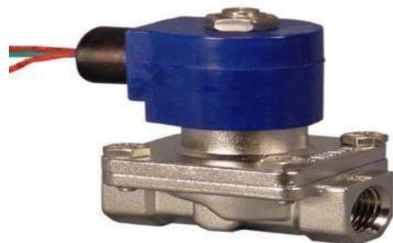
Fig. solenoid valve

The directional valve is one of the important parts of a pneumatic system these are also used to operate a mechanical operation which is turn operates the valve mechanism.