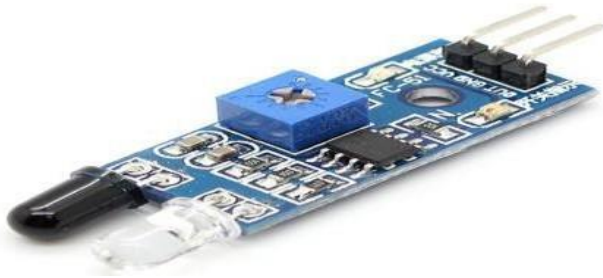
Fig. IR SENSO

distance by laser altimeters . The sensor is used to detect the obstacle