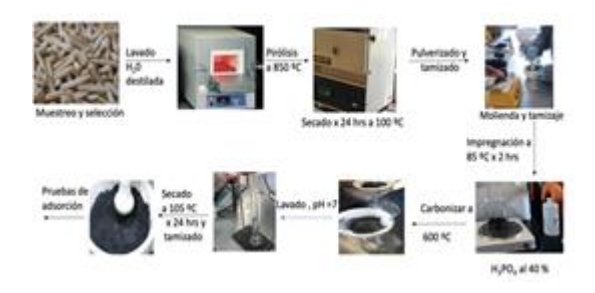
Fig 1.- Methodology for obtaining activated carbon from maize cob heart.

To improve absorption capacity, the carbon obtained was activated by a chemical treatment of phosphoric acid [7]. The impregnation was carried out at 85°C for 2 h with 40% phosphoric acid solution, after treatment, the samples were heated to 600°C, with a temperature increase of 8°C/min. Subsequently, the samples were washed with distilled water and constant stirring, the water was changed every 24 h until the pH of the sample was 7. Finally, the material obtained was dried at 105 +- 5°C during 24 h, with the purpose to eliminate humidity in the samples, as you can see in Figure 1.