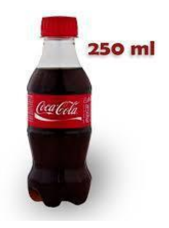
Fig 10.Coco cola plastic bottle