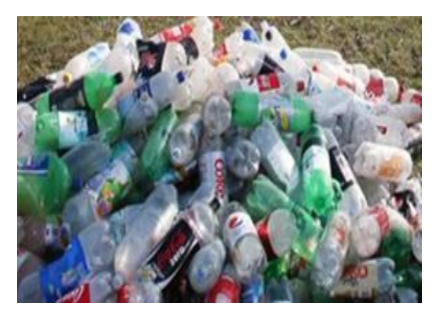
Fig 1. Plastic bottle waste

various regions of the world to look at the feasibility of employing plastic bottles in concrete blocks.public has questioned the strength of bottle bricks because they are manufactured from plastic bottles. This doubt is dispelled, however, because bottle bricks are both stronger and bulletproof than regular bricks. Buildings made out of plastic bottles give thermal comfort as well as a healthy environment with all of these considerations in mind, we attempted to investigate the relative strength and cost of bottle bricks against traditional bricks.