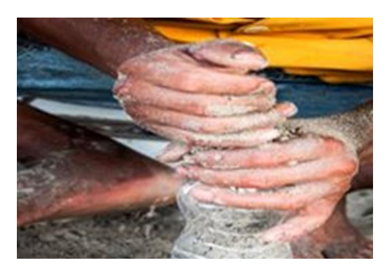
Fig 9. Compacting the bottles