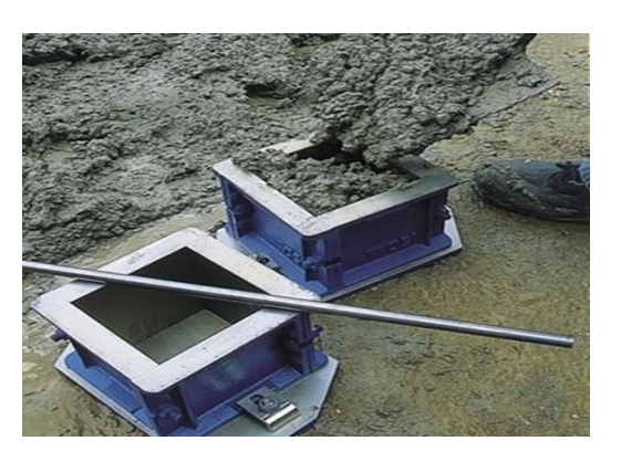
Fig 7. Mould preparation