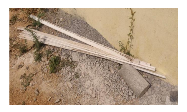
Fig 6. Plastic strips