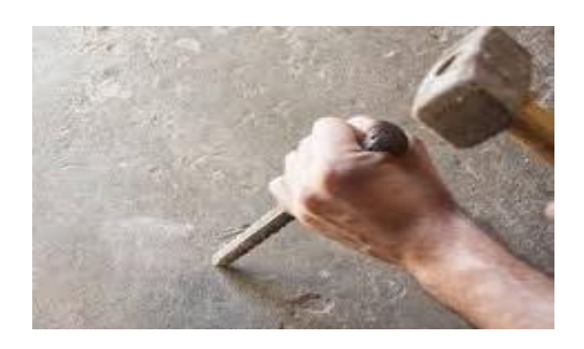
Fig 5. Chipping

Chipping is the process of removing weld spatter, rust, or old paint from a surface. Chipping is commonly used to improve adhesion to a smooth surface.