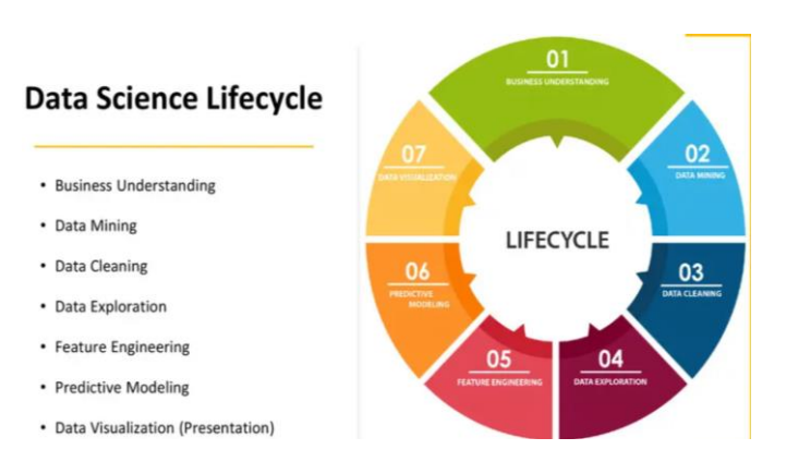
Fig -2: Data Science Project Lifecycle

Machine learning (ML) technologies are used in HAR systems to develop patterns that may be used to characterize, evaluate, and predict data [5]. It's used to categorize activity recognition errors. Patterns must be discovered from a set of given examples or observations termed instances in a machine learning scenario. This type of input set is referred to as a training set. Each instance is a feature vector derived from signals collected over a period of time. The examples in the training set may or may not be labeled, that is, allocated to a certain category (e.g., walking, running, sleeping, etc.). Labeling data is not always possible because it may necessitate an expert personally examining the instances and assigning a label based on their knowledge. Many data mining solutions make this procedure difficult, expensive, and time-consuming.