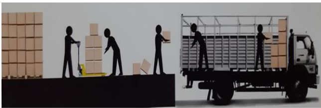
Fig.1. Loading without Using Telescopic Belt Conveyor

When the transportation of product is depends on labors, there are more chances of accident. Its take more time and energy while loading and unloading material from vehicle as show in the above figure. Due to automation, we not only save energy, but we use our energy in an efficient way. Including this we reduce the cost of conveyor belt since automation. The plant and its maintenance; its flexibility for adaptation and its ability to carry a variety of loads and even be overloaded at times. More importantly a development team can easily monitor the design and accelerate the work.