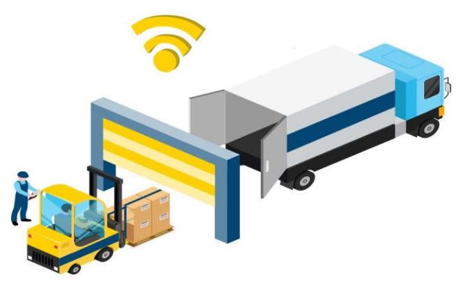
Fig -2: Tracking & Identification at Site Gate 4.2 Construction Activities

After receiving materials on construction project site, documentation is necessary. For these workers are sent for manual counting and checking of materials. This consumes lot of time. In RFID enabled system, when tagged items of delivery reach site, they get identified automatically and quantities of materials are get loaded into controlling computers. All these processes take only seconds of time. By this approach time can be saved and accuracy can be achieved.