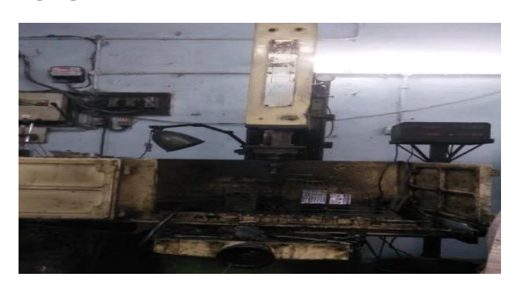
Fig: die sink EDM process