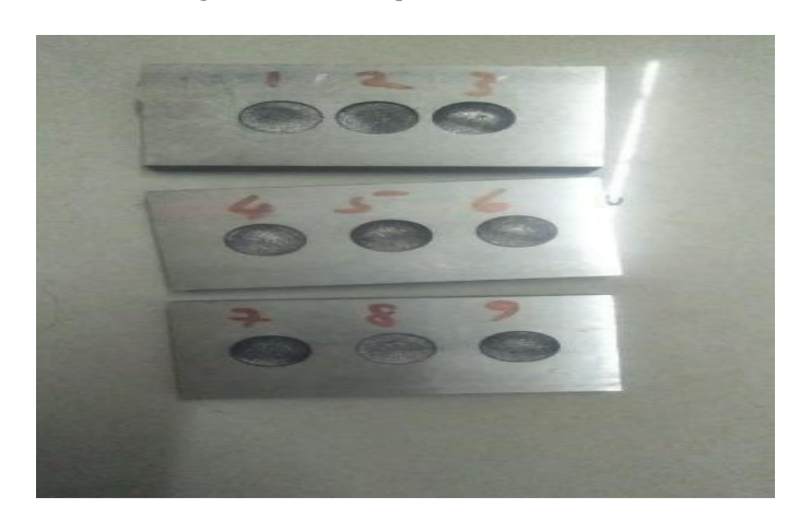
Fig: Final work piece