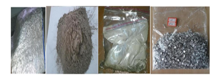
Fig 1:AA 2014, Fly Ash, SiC, Mg

AA 2014 melted above 850 °C in a crucible and the reinforcements were preheated up to same temperature for proper mixing and oxidation removal. Preheated SiC and fly ash were mixed in the metal slurry manually at 850 °C. The molten metal poured in preheated moulds and allowed to cool. Casted metal matrix was machined to remove cluster formation on the surface and then cut into required dimension by using fan-saw cutting machine.