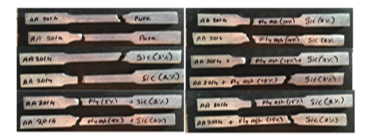
Fig 3: Work pieces before and after tensile tests