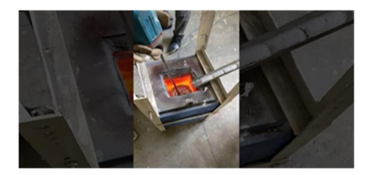
Fig 2: Stir Casting arrangement

After Stir casting process of AA 2014 and fly ash, SiC, the molten metal is poured in the die and let it to be solidification for some time and then take these blocks to cut dumbbell shaped work pieces.