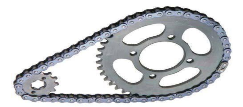
Fig (3) chain and sprocket

There is two sprocket are there, one is connected to axel another one is connected to handle. This two sprocket is inter connected with help of chain. Same arrangement as bicycle.