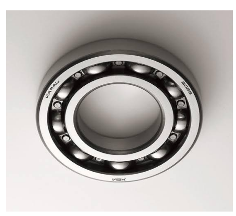
Fig (5) Bearing

A bearing is a mechanical element that's constrains relative motion to desired motion as well as reduce friction between moving parts. In this we used two ball bearing at axel and intermediate gear respectively.