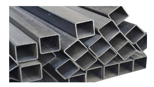
Fig (7) Square pipe

Simple steel square pipes are used in this machine for structural arrangement purpose. This arrangement supports whole mechanism.