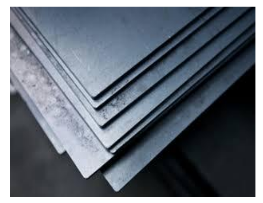
Fig (8) Metal sheet