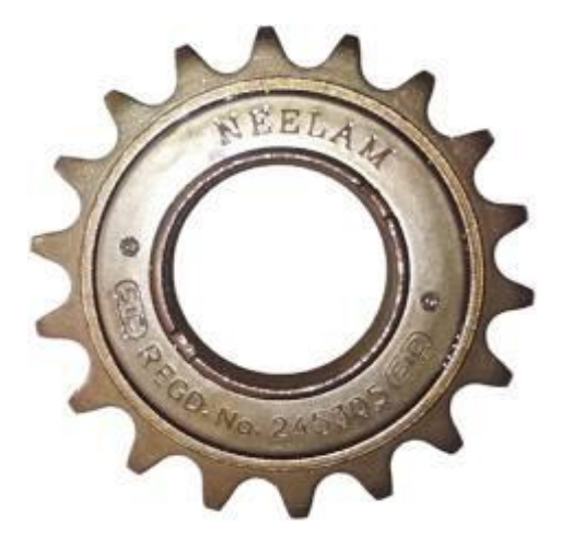
Fig (4) Gear