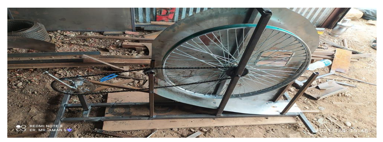
Fig (1) model diagram