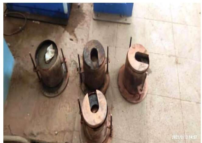
Figure-3: California bearing ratio (CBR)