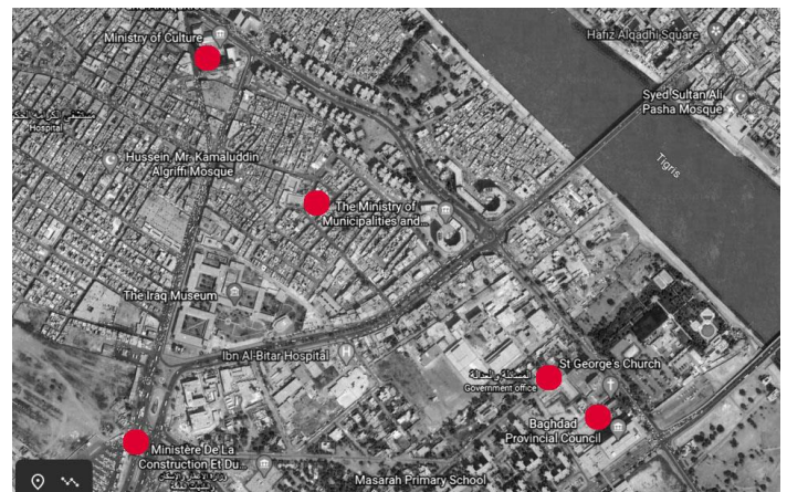
Fig- 6: shows the political centers near Karimat.

The extent of the proximity of the region to political, critical, or targeted centers: