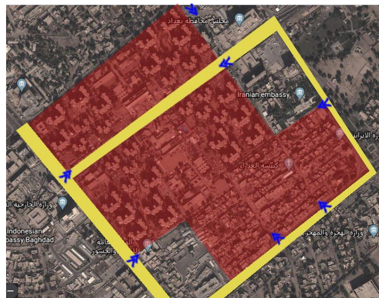
Fig-8: Clarity of entrances to the neighborhood

The visibility of the entrances to the neighborhood: The entrances are clear, as shown below: