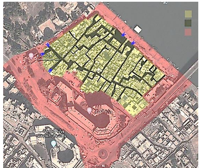
Fig-4: The main entrances to the area

The clarity of the entrances to the neighborhood: that the multiple and thin entrances are not safe, and there are basic entrances that are safe, as shown in Figure (4).