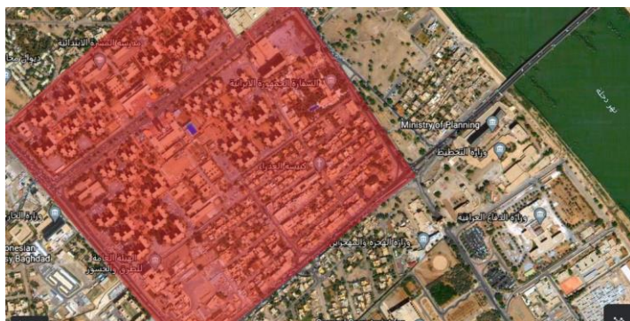
Fig-11: The area near the Tigris River

How close the house is to nature: the vertical part contains green places, while the horizontal is limited to home gardens, which gradually receded, and what distinguishes the area is its proximity to the Tigris River.