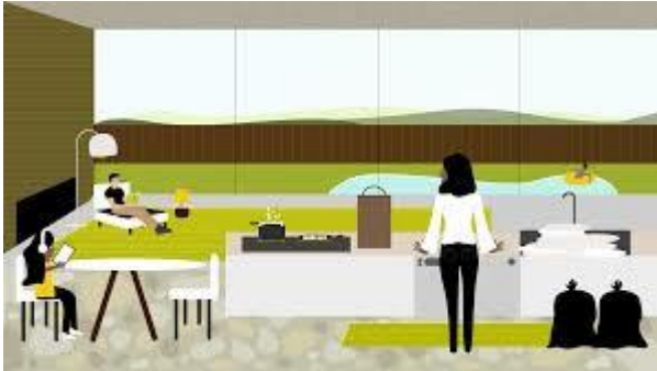
fig-1: an example of the design features

areas (Gallant, 2017, p22). As in Figure (1)