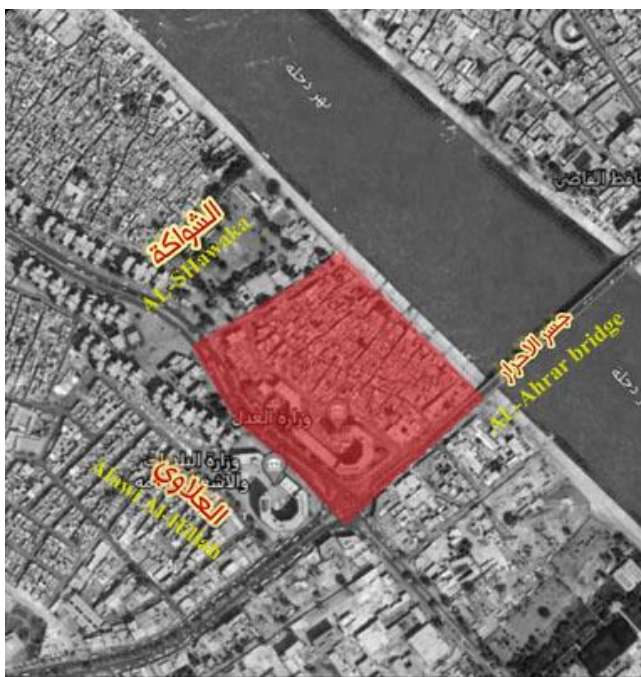
Fig-3: Al-Kuraimat area and its environs

It is a traditional locality located on the western side of Baghdad, on the side of Al-Karkh, surrounded on the northeast by the Tigris River, on the south by Karada Maryam, and from the northwest by Al Shawka, and Alawi Al-Hillah and Al-Durayyin district from the west, and adjacent to it is Al-Ahrar Bridge.