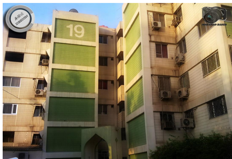
Fig-10: Additions to Residential Buildings Oases (Basem, 2020)

-The size of the additions represented by placing iron on windows and doors and raising fences: Despite what is known in vertical residential complexes of placing iron on balconies and external doors to buildings in large quantities and a large spread, but in the Salhia residential complex this is partial. As for horizontal housing, people are keen to put iron bars on the windows. As for the houses built in the 1970s and 1980s, and some homes of the 1990s, they have a fence and a low curtain.