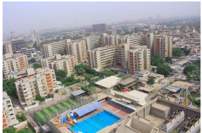
Fig-9: Shared and Green Places

- Shared entrances are safer than open entrances: residential buildings have common entrances, while the horizontal ones have single entrances.