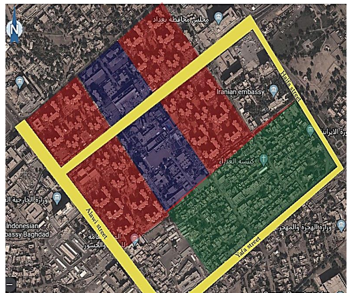
Vertical housing Horizontal Service center Surrounding streets

Horizontal housing: It is located to the southeast of the Salhiya residential complex, and it is a role with large areas, up to 600 square meters, but most of them were divided into several houses, and some of them were converted for commercial purposes.