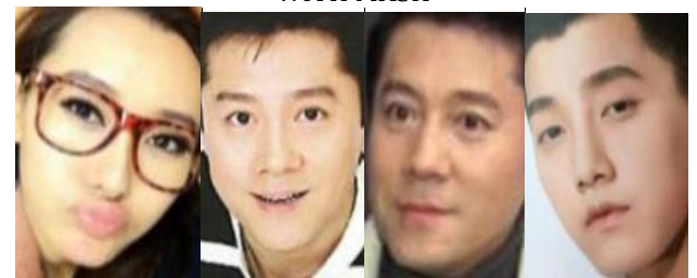
Fig -3: Dataset collection