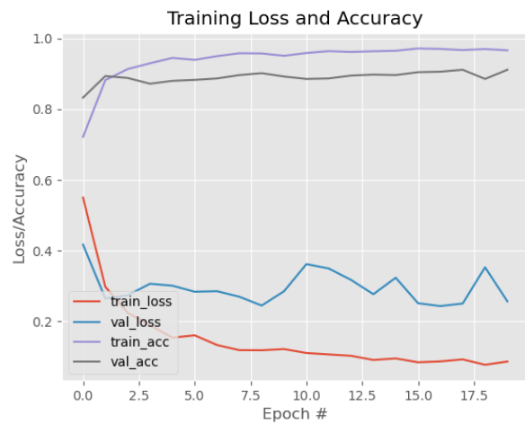
Chart -1: Result analysis