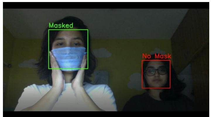
Fig-4: Snippet of the system.