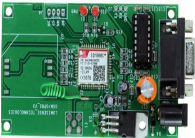
Fig4.2 GSM Modem

GSM (Global System for Mobile communications) is an open, digital cellular technology used for transmitting mobile voice and data services. SIM800 GSM modem accepts any GSM network and can act as SIM card. It also like a mobile phone works with its own unique phone number. It has a GSM/GPRS 900/1800MHZ performance for voice, Data, Fax and SMS in a small form factor and with low power consumption. The space requirement for this model is also less as its configuration is 24mm x 24mm x 3mm which makes it applicable for slim and compact demand of design.