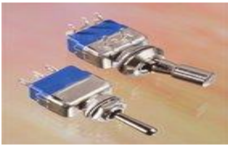
Fig4.4 Toggle Switch