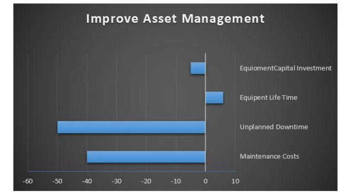
Fig-5: Improve Asset Management <sup>[5]</sup>

In Industry 4.0, predictive maintenance ensures the equipment loss can be detected before it occurs. Repetitive behaviours that precede faults can be detected by ML-powered devices, which can alert the teams and plan an investigation. Such devices also improve over time, being capable of detecting ever more granular shifts and assisting you in continually optimising the manufacturing operation.