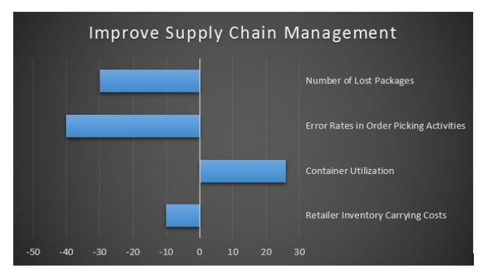
Fig-4: Improve Supply Chain Management <sup>[5]</sup>

You will boost your market predictions by at least 85% by combining your inventory management scheme with a big data analytics approach. Complex systems such as SAP S/4HANA, allow companies to take advantage of Industry 4.0 and data analytics to quickly adapt supply to consumer demand. You can also perform real-time supply chain optimization to obtain a better understanding of potential bottlenecks, allowing you to expand your company.