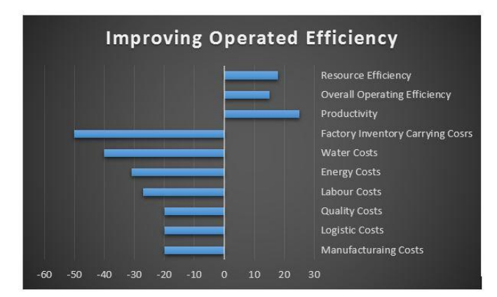
Fig-2: Improving Operated Efficiency [5]

As a result of Industry 4.0-related technology, several areas of the production line can become more effective. Some of these efficiencies have already been listed less computer maintenance as well as the potential to produce more goods at a higher rate. Improved performance can also be seen in quicker batch changeovers, automatic monitor and trace procedures and automated monitoring. NPIs (New Product Introductions) become more effective as well as do management decisions and more.