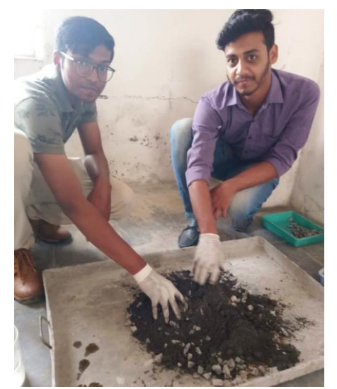
Fig.No-1: Mixing of Concrete

The alkaline activator solution is prepared before 24 hours of casting. Initially, all dry materials were mixed properly for three minutes. Alkaline activator solution is added slowly to the mixture. Mixing is done for 5 minutes to get uniform mix.