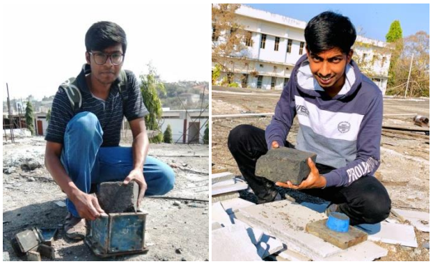
Fig.No-2: Casted Specimens