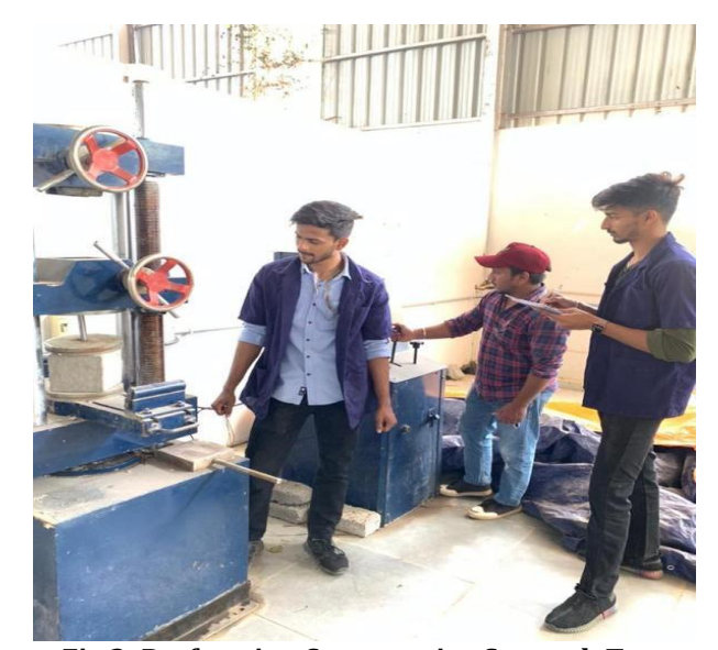
Fig.2: Performing Compressive Strength Test

W/C ratio adopted for M20 grade is 0.50 were as for M25 grade 0.45 W/C ratio is adopted. Following table gives the compressive strength test results of recycled aggregate concrete with different percentages of aggregates.