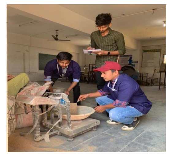
Fig-1 Batching of Aggregates

The performance of recycled coarse aggregate can be reduced due to the presence of impurities, which emanated from demolition process including porous mortar and cement paste attached to the parent aggregate. The effect could also lead to general reduction in characteristics of recycled aggregate concrete. Some of the impurities identified through visual inspection from the recycled coarse aggregate. The average percentage impurities present in the recycled coarse aggregate amounted to about 5% of the total mass of the sample. Although there is visual evidence to show the presence of adhered mortar on the parent material, it was practically impossible to estimate their percentage. However, the adhered mortar does not seem to be of significant quantity but its impact on the characteristics of recycled coarse aggregate concrete cannot be neglected.