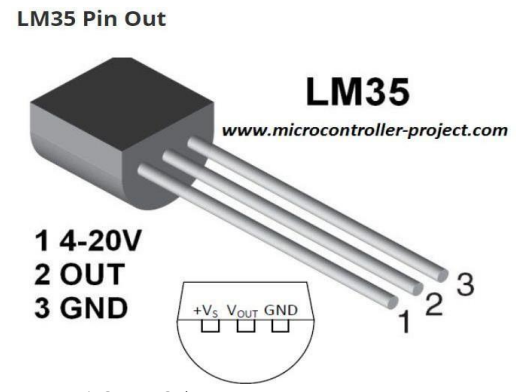
Fig 1.2-LM35 Temperature sensor

LM35 is an integrated analog temperature sensor whose electrical output is proportional to Degree Centigrade. LM35 Sensor does not require any external calibration or trimming to provide typical accuracies. The LM35's low output impedance, linear output, and precise inherent calibration make interfacing to readout or control circuitry especially easy. Main advantage of LM35 is that it is linear i.e. 10mv/°C which means for every degree rise in temperature the output of LM35 will rise by 10mv. So if the output of LM35 is 220mv/0.22V the temperature will be 22°C. So if room temperature is 32°C then the output of LM35 will be 320mv i.e. 0.32V. LM35 can also be directly connected to Arduino. The output of LM35 temperature can also be given to comparator circuit and can be used for over temperature indication or by using a simple relay can be used as a temperature controller.[6]