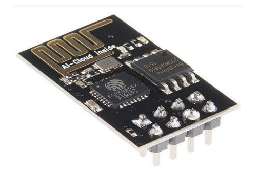
Fig 1.4-ESP8266 Wi-Fi Module

ESP8266 is an highly integrated chip designed to provide full internet connectivity in a small package. It can be used as an external wifi module ,using the standard AT command set firmware by connecting it to any microcontroller or directly serve as w wifi enabled microcontroller. It has built in TCP/IP protocol stack and it also supports antenna diversity.[1] It is normally used in IOT cloud based projects and is the most widely used wifi module because of its small size and low cost. It operates from 3V to 3.6V and requires external logic level converter for using 5V supply.We can connect this module to any microcontroller like pic microcontroller, Arduino and we can use it as a stand-alone device.[5]