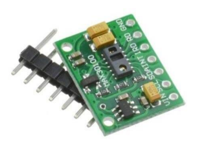
Fig 1.3-MAX30100 Sensor

The MAX30100 sensor is used to measure heartrate & blood oxygen levels. It has 2 LED's emitting red & infrared light. Infrared light is used for pulse rate. And both the lights are required for measuring blood oxygen levels. It has ultralow power operation which increases battery life for wearable devices. It has fast data output capability. It also consumes low power (operates between 1.8V and 3.3V). This sensor is generally used in wearable devices, medical monitoring systems etc. [4]