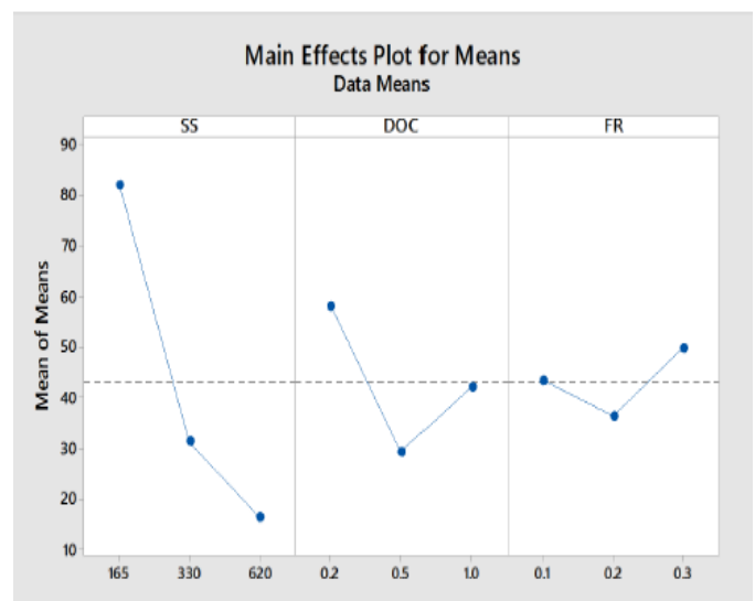
Fig.3.2 Main effects plot for SN ratios (MRR)

The analysis is made with the help of a software package MINITAB 18. The main effect plots are shown in Figs. 1 and 2. These show the variation of individual response with the four parameters, i.e., cutting speed, feed, depth of cut and nose radius separately. In the plots, the x-axis indicates the value of each process parameter at two level and y-axis the response value. Horizontal line indicates the mean value of the response. The main effects plots are used to determine the optimal design conditions to obtain the optimum flank wear. Figure 1 shows the main effect plot for flank wear. According to this main effect plot, the optimal conditions for minimum flank wear are: