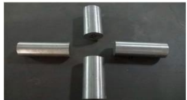
Fig. 4.1: Some of the machined samples