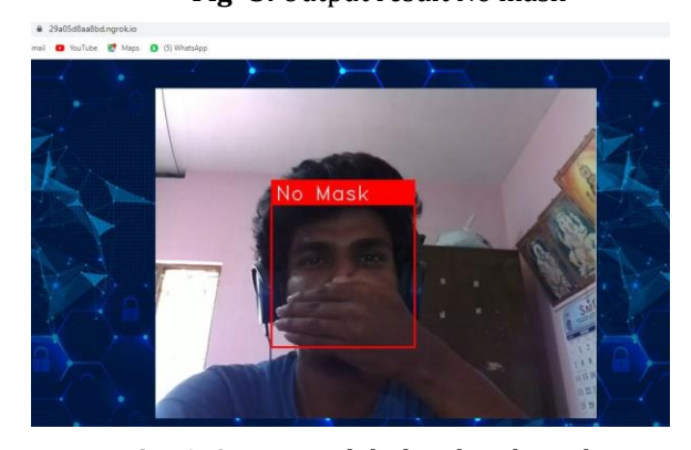
Fig -6: Output with hiding hands on face

© 2021. IRIET Impact Factor value: 7.529 ISO 9001:2008 Certified Journal | Page 3073