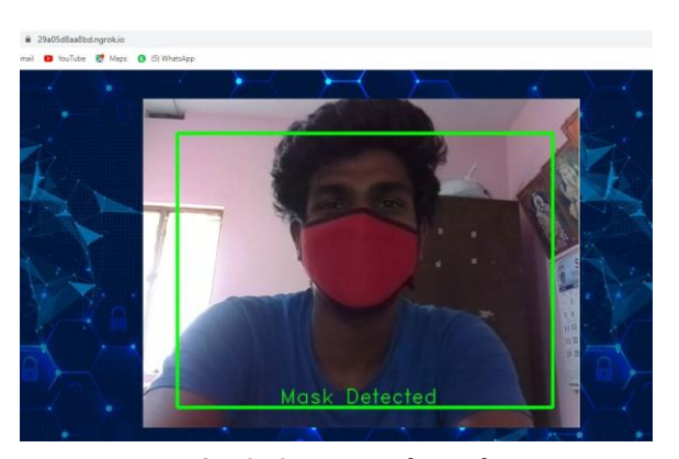
Fig -9: Output with Mask

e-ISSN: 2395-0056 Volume: 08 Issue: 04 | Apr 2021 www.irjet.net p-ISSN: 2395-0072