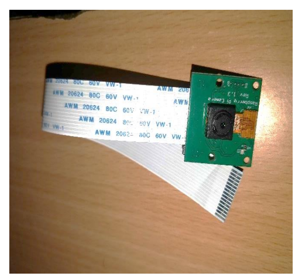
Fig -4: Raspberry pi with Camera

The camera is compatible with all Raspberry Pi versions 1, 2, 3, and 4. It can be accessed through the MMAL and V4L APIs, and numerous third-party libraries, such as the Pi camera Python library, have been developed for it. It represents a significant improvement in image quality, color fidelity, and low-light efficiency. It has video modes of 1080p30, 720p60, and VGA90, as well as still capture. It connects to the Raspberry Pi's CSI port via a 15cm ribbon cable.