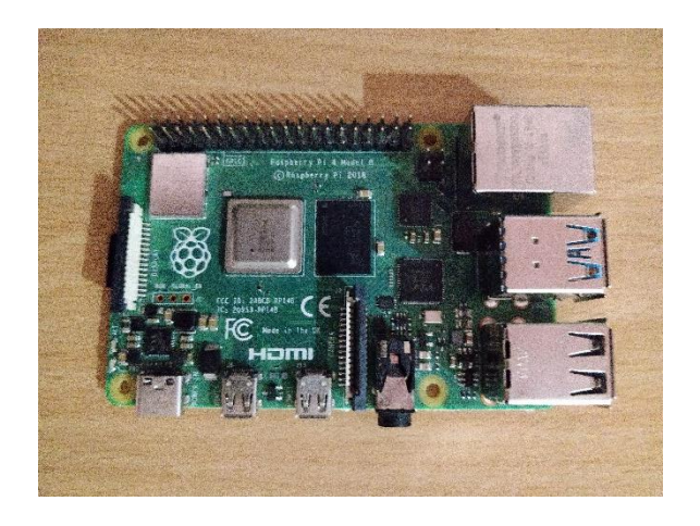
Fig -3: Raspberry pi

e-ISSN: 2395-0056 Volume: 08 Issue: 04 | Apr 2021 www.irjet.net p-ISSN: 2395-0072