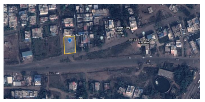
Fig -3: Location of site 2