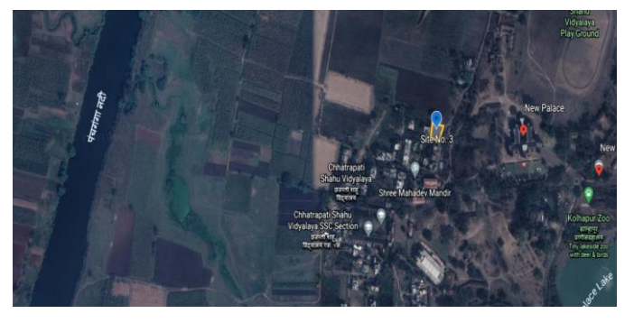
Fig -4: Location of site 3