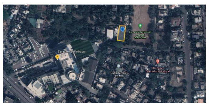
Fig -2: Location of site 1