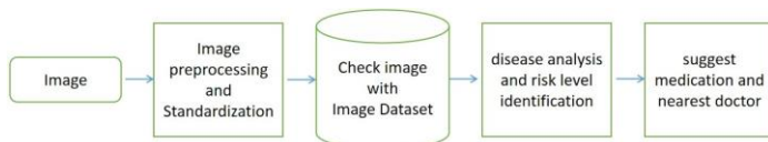
Fig -2: Flow Diagram